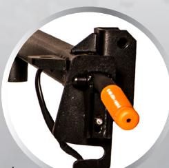
Auto-Latch Mechanism Handle