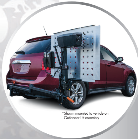
*Shown mounted to vehicle on Outlander Lift assembly